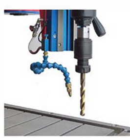
Tool cooling system